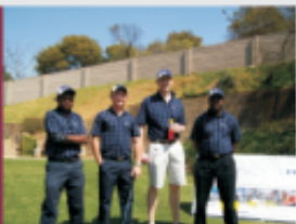
Confederations Cup 2009, South Africa GLM & Associates Hospitality Strategy and Implementation